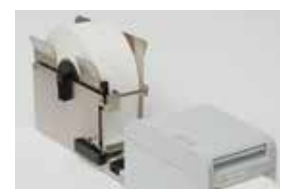
<FP-32L with roll paper unit>

"Roll Paper Unit"(option) can help to print for roll paper with big diameter up to 200mmΦ.